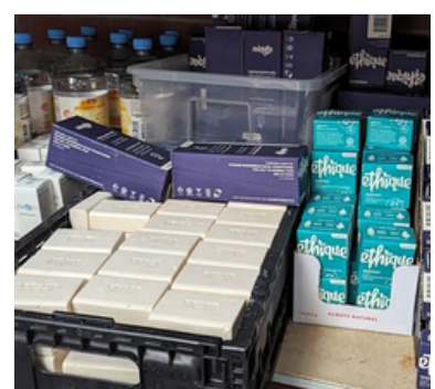
Left: St Mary's Parish Pantry, Geelong